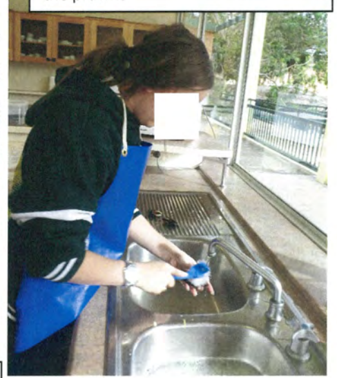
(PA1) preparing the shellfish scrubbing the shell and removing the beard