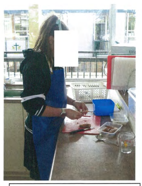
(PA1) preparing the prawns by removing the shells and de-veining the prawns