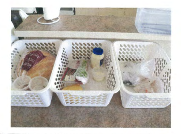
(PA1) separating ingredients depending on their category, dairy, seafood and dry ingredients