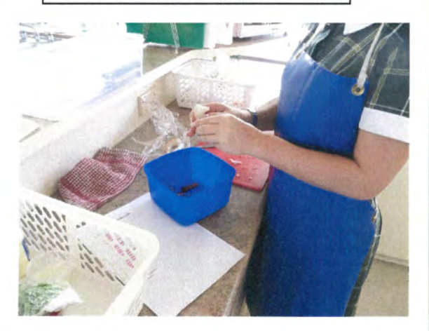
(PA1) making sure all the fish look visually appealing and maintain quality control